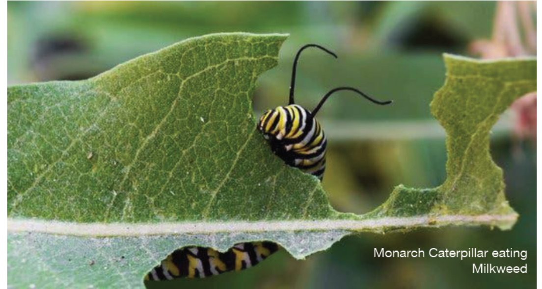
Monarch Caterpillar eating Milkweed