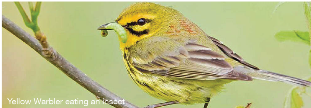
Yellow Warbler eating an insect